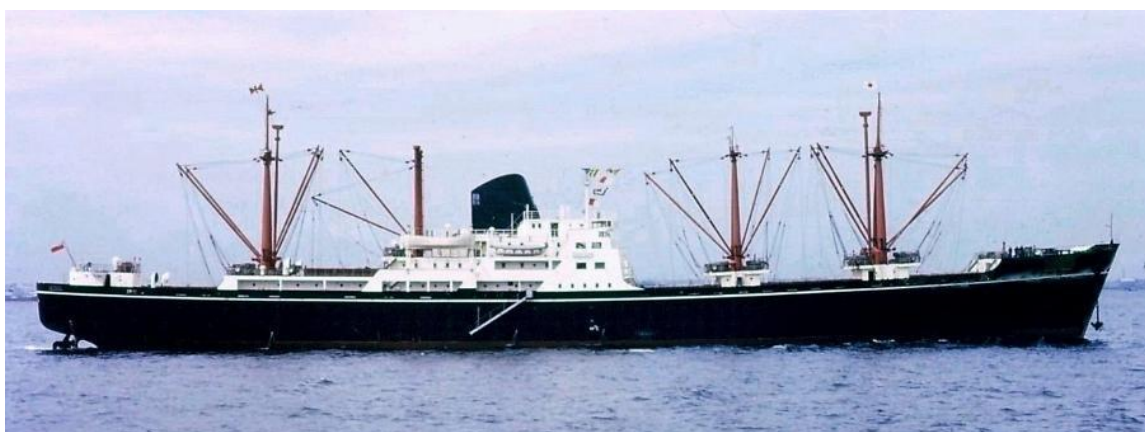
TIENTSIN in profile, bipod masts obscured.

In fact, the two French sisters, Tientsin ex Maroua ex Frontenac and Tsingtao ex Manga ex Duquesne that CNCo had bought secondhand from Chargeurs Réunis in December 1961 for the Australia-Japan wool trade, were much more obviously the inspiration for Hunan than Kweilin and the 'K'-class, as photos reveal. Hunan was considerably longer (450.0 vs 421.7' b.p.), bigger (10,585 vs 7060 dwt) and faster (18 vs 16 knots) but her sleek design with all accommodation amidships was recognisably adapted from the French pair, notwithstanding the additional mast (forward) and kingposts (aft). Both delivered in 1955 and, as their original names Duquesne and Frontenac might suggest, for Cyprien Fabre's transatlantic route to Canada's St Lawrence River and Quebec, they were part of the first wave of gracefully streamlined French cargoliners delivered from the mid-1950s onwards. Though somewhat scaled down from Messageries Maritimes' Godavery (1955) class, they had an almost identical layout, including the distinctive bipod masts, except that one deck of the midships accommodation block was transposed to a trunked No. 4 hatch, a feature retained on Hunan – Ambrose Greenway's book 'Cargo Liners: An Illustrated History' (2012) shows the comparison at Page 114. It may also be observed that Hunan , like Kweilin , was slab-sided below the Boat Deck, giving extra width to the officers' cabins, and, in the absence of passengers, carried only one fibreglass boat each side.