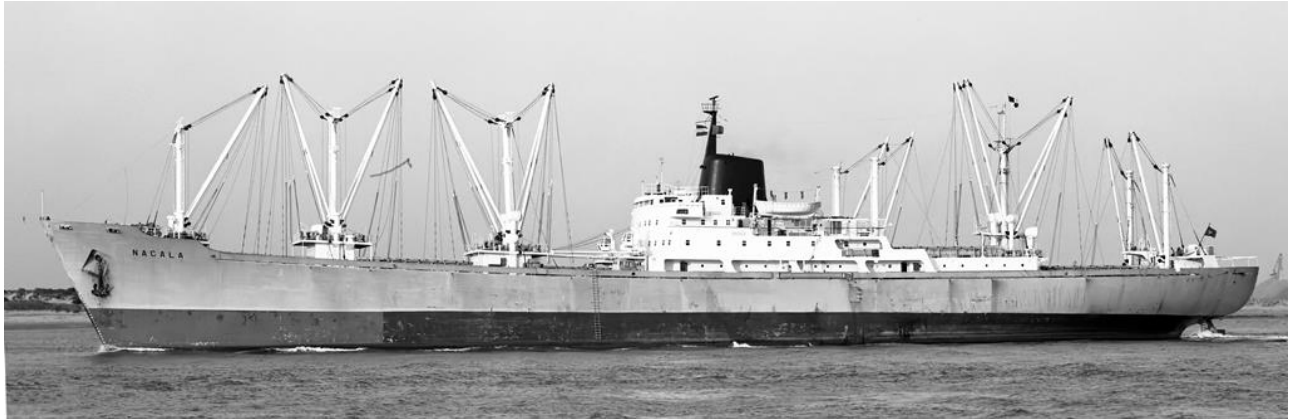
NACALA passing Hook of Holland inbound, 18 June 1970, en route from Hamburg via Rotterdam and Liverpool to Leixoes and Lisbon (M. Cranfield).

at Leixões (Oporto) and Lisbon before proceeding via the Cape to Mozambique, turning round at Lourenco Marques (now the capital Maputo), Beira and Nacala, the northernmost deepwater port in Mozambique and also terminus of the railway to/from Malawi. The range from Northern Europe to East Africa was much the same as from SE Australia to Japan and East Asia and the number of loading and discharge ports also fairly similar. Sailing time between Lisbon and East Africa was about a month each way, allowing a comfortable three-monthly rotation. At times Nacala also traded on the North Europe to Angola (Lobito) service and occasionally on the Angola to US/Canada service. Cia Nacional could readily have employed two or three such ships.