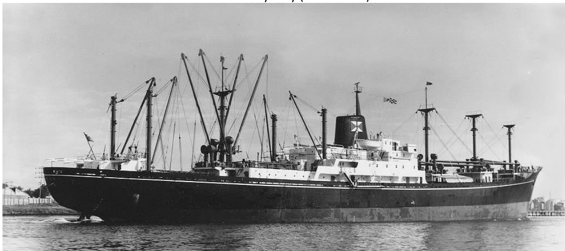
HUNAN arriving at Melbourne with Swire's identifying houseflag on funnel (R. Varns*).