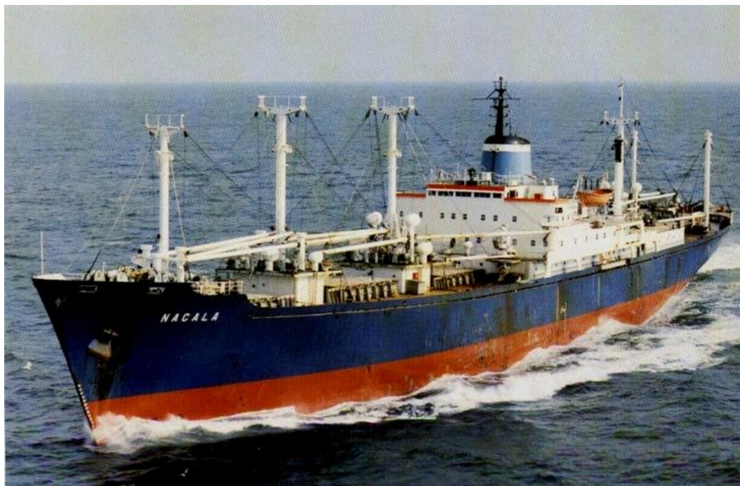
NACALA at sea in new livery.

fairly quickly sold. Nacala passed for 50.7 million escudos to the newly established, state-owned Transportes Marítimos Internacionais (PORTLINE) of Lisbon – which still operates as a private company under Chinese ownership – but they had no interest to return her to trading. Instead, she was resold to local breakers Joa Luis Russo e Filhos [Sons] and on 29 January 1986 was delivered at the industrial port of Setubal, south of Lisbon. Demolition was completed by September of that year, though her register was not closed until 24 June 1988.