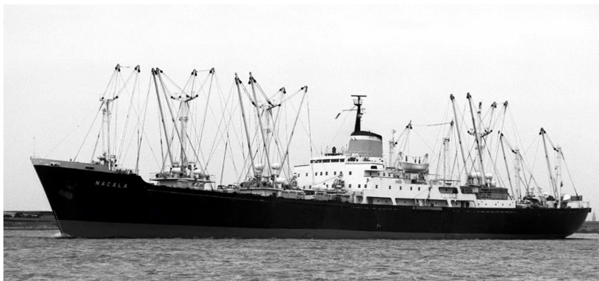
NACALA outbound from Rotterdam, 29 May 1972, with freshly painted black hull and light blue base to the funnel (M. Cranfield).

There were also dramatic changes in ownership. In 1968, when Nacala (II) was purchased, Cia Nacional had belonged to the big industrial conglomerate Companhia União Fabril (CUF Group), which also controlled the industrial carrier Sociedade Geral de Industria, Comercio e Transportes (SGCIT), the tanker company SOPONATA and the Lisnave shipyards. On 1st January 1972, the fleet and goodwill of Soc. Geral was transferred to CNN, boosting the fleet by another eight cargo ships. Around this time, the Cia Nacional fleet was repainted with more practical black hulls and a black-topped white funnel with a very wide light-blue band. Three years later, after the revolutionary government had taken power, Companhia Nacional was nationalized.