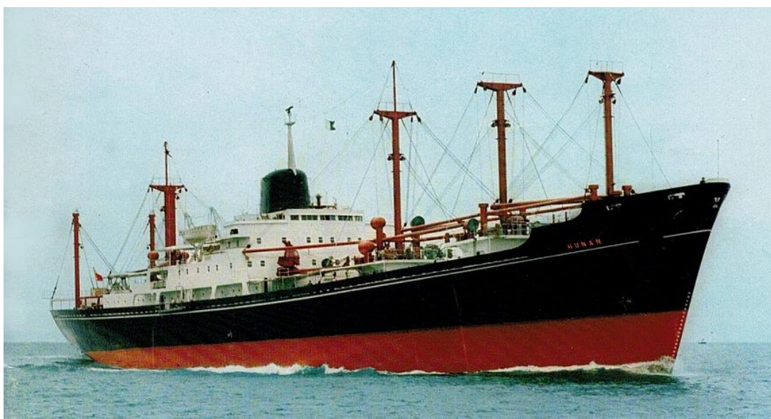
HUNAN on light-ship trials ('Taikoo Dockyard' No. 20/1966, edited S. Kentwell).

The engine, built in 1965 by Scotts' at Greenock and shipped out to Hong Kong, was a 2-stroke, 6-cylinder (400 x 1550mm), turbo-charged Scott-Sulzer 6RD90 diesel burning heavy fuel oil and developing a maximum of 13,610 bhp at 119 rpm to drive the ship at a fast 17-18-knot service speed, about 3½ knots faster than Kweilin . On trials she reached a speed of 14.85 knots at 87 rpm and 18.925 knots at 113.3 rpm. Curiously, there is no report of a maximum trial speed at full 119 rpm so perhaps this was not attempted. Electrical power was supplied by three 625-kVA, 400-volt, 3-phase, 60-cycles W.H. Allen 'Transidex' diesel alternators directly coupled to Allen 6BS37D, 6-cylinder, 4-stroke, turbo-charged engines running at 450 rpm. The main gauge board near the main engine controls had both audio and visual alarms for lubricating oil and fresh- and salt-water systems.