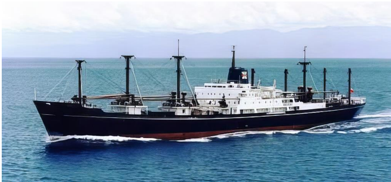
HUNAN in St George's Channel at speed with 'a bone in her teeth'. By 1968 new ships would have bulbous bows to smooth the bow wave and reduce friction.