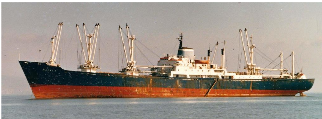
NACALA laid up in Mar da Palha anchorage, Lisbon in 1985, unchanged from her original configuration.