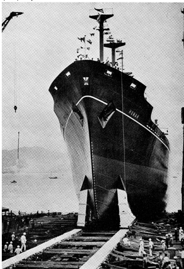
HUNAN's launch, 25 Oct. 1965, showing her fine lines (no bulbous bow) ('Taikoo Dockyard', No. 20/1966).