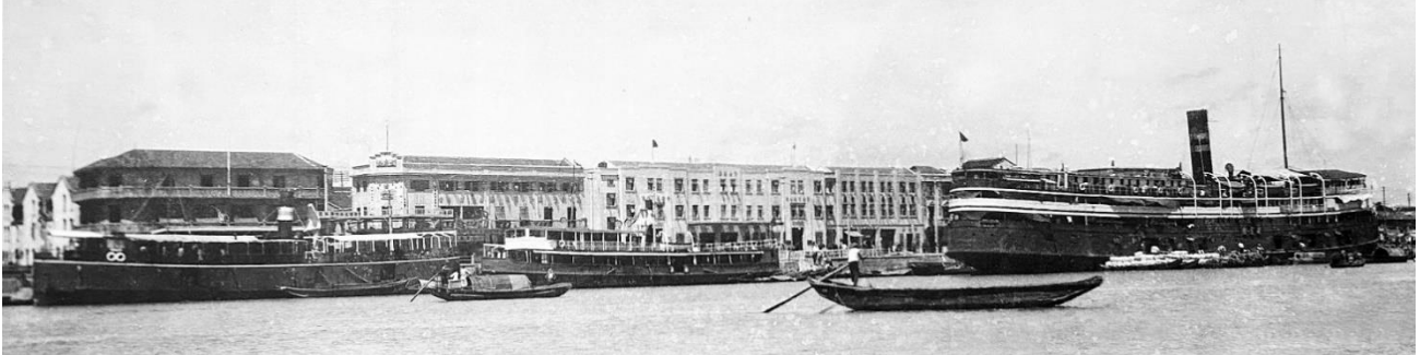
Yu Ya-ching berths and warehouses at the Ningpo Bund in 1934. The left and centre ships are surmised to be YAOPEH and TZEPEH. The much larger Shanghai steamer HSIN NINGSHIN is on the right.

Liner services were still restricted to the Yangtse River and the original services to Ningpo and Foochow but tramp steamers ranged farther afield, often on charter. Photos taken in the 1930s show SPSNC freight ships in colours of Japanese charterers such as Yamashita Kisen.