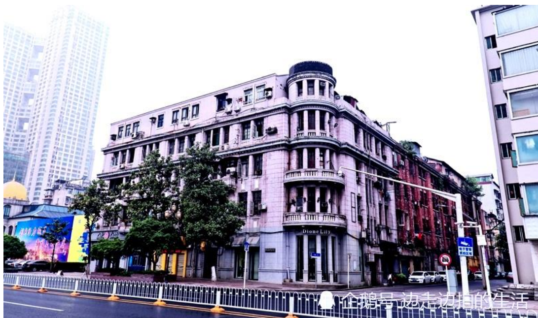
Present day view of former San Peh building in Hankow with its ship's funnel-like entry (Internet).

to be switched to the Yangtse River between Shanghai and Hankow.