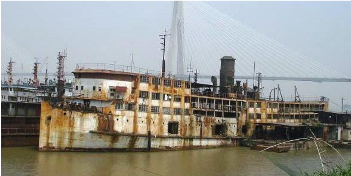
Retired DONG FANG HONG 6 ex TEH ON ca.2015 at Wuchang.