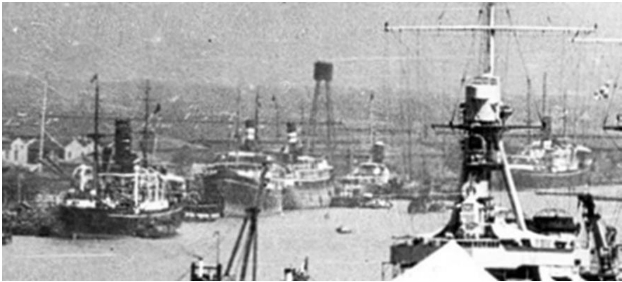
At centre left two San Peh coastal steamers, perhaps Chingpu and Hsin Ningshin, tied up at Shanghai on 19 August 1937.